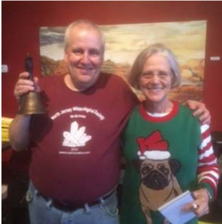
Sparta Historical Society Field Trip Photos – November 27, 2016