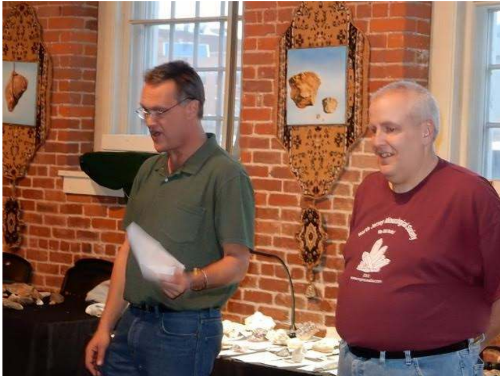
Holiday Party Photos – December 4, 2016