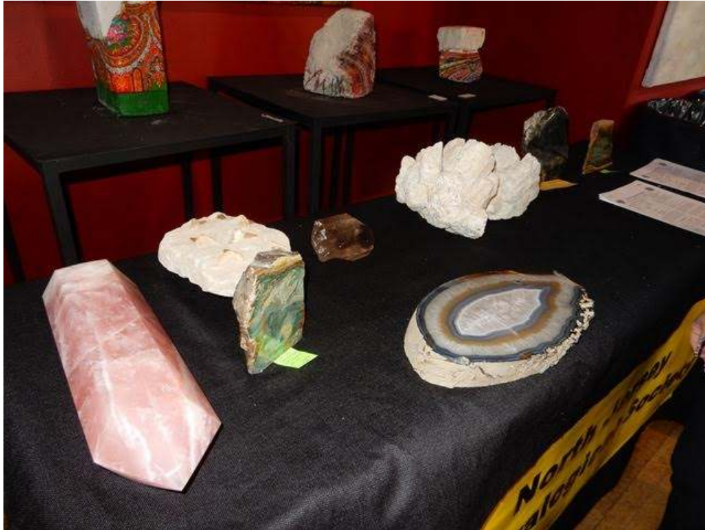
Holiday Party Photos – December 4, 2016