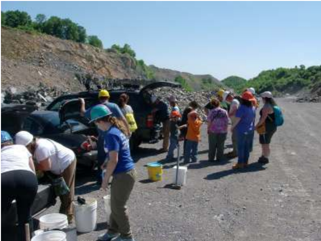
Club members wait to sign in and hit the rocks!