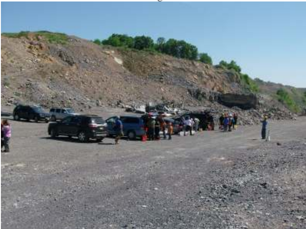
Club members arrive at the quarry in Middleburg and prepare to start collecting. The machinery working on the hill behind the cars is preparing the flowstone specimens for our group to collect.