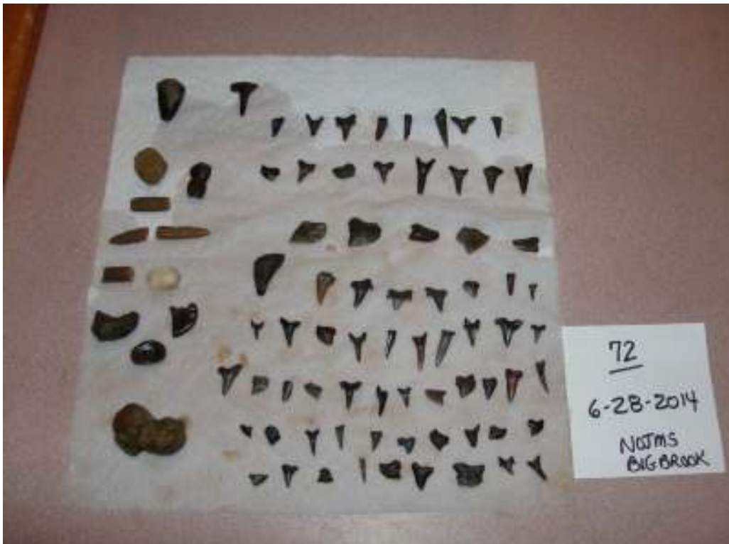
Jeff's finds, including a rare Mosasaur tooth!! (Top Left)