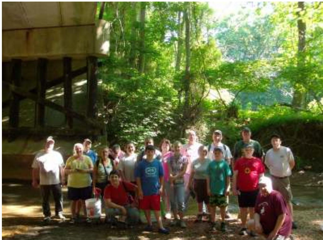
Club members pose for our group photo under the Boundary Rd. Bridge in Big Brook.