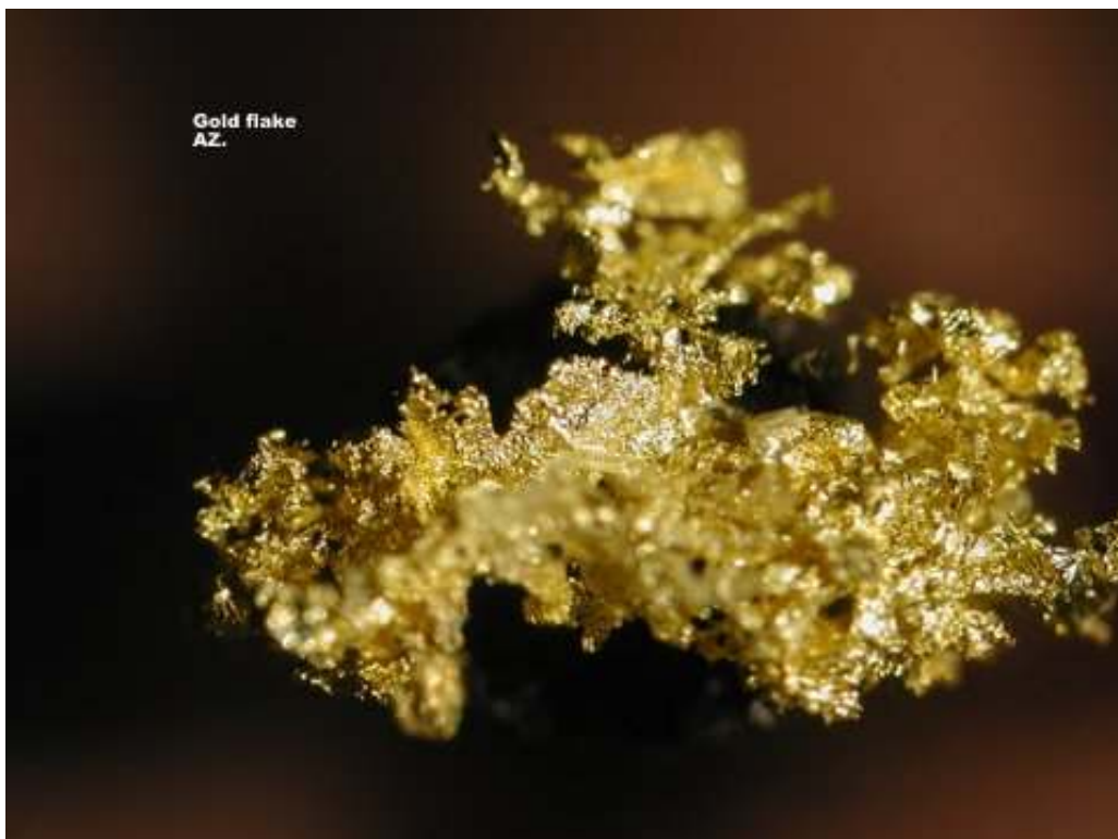
GOLD Flake from AZ