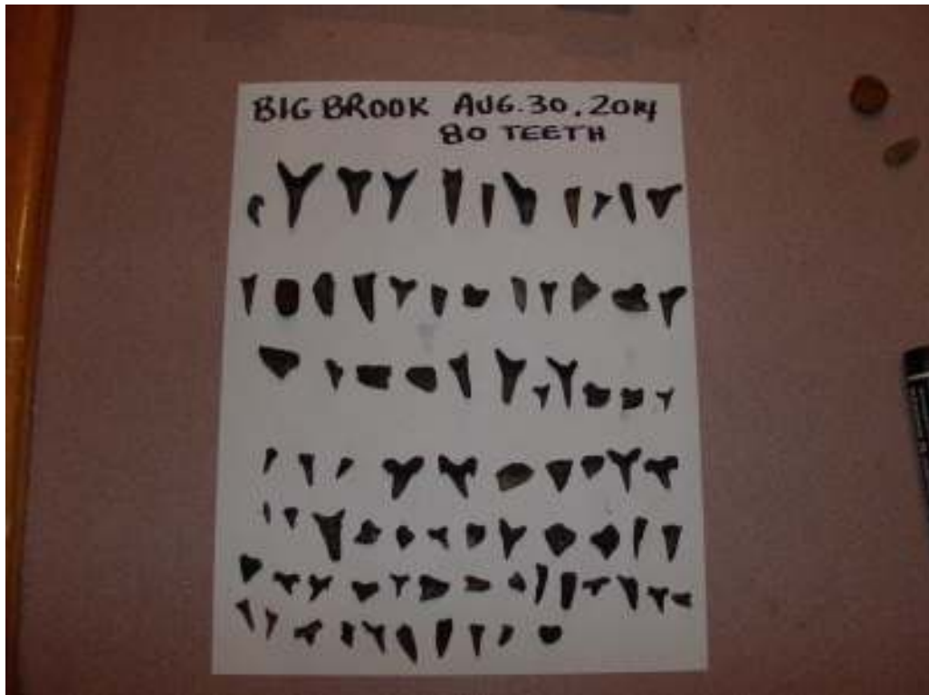
Jeff's "haul" from the brook!