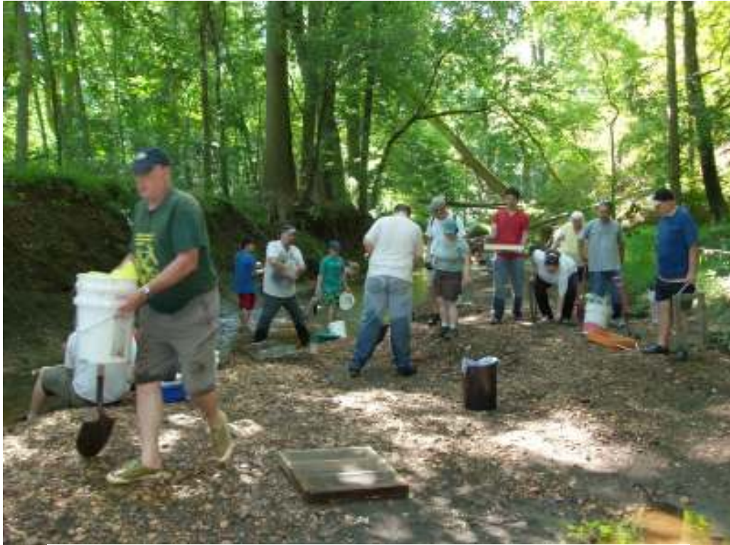
Attendees spread out through the brook and begin the hunting!