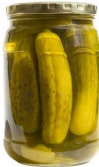
An inside joke for those that went on the trip!!!