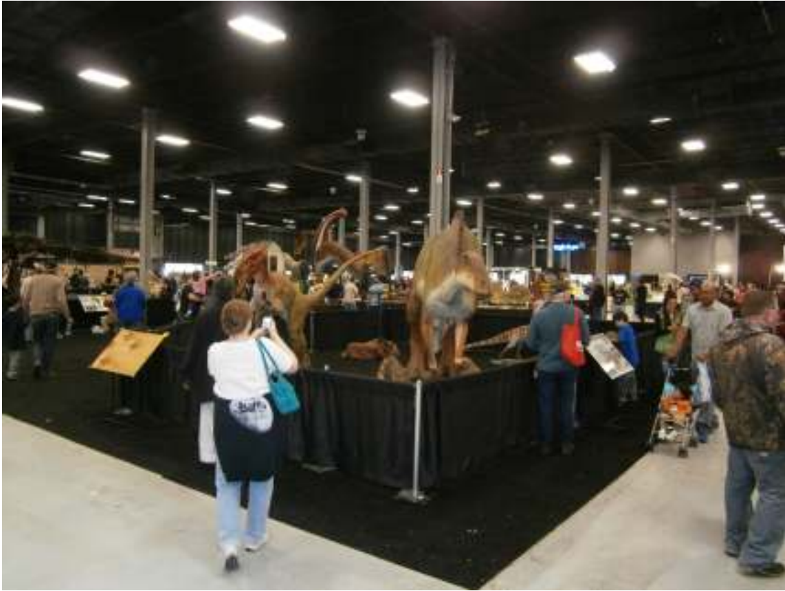
Franklin Show