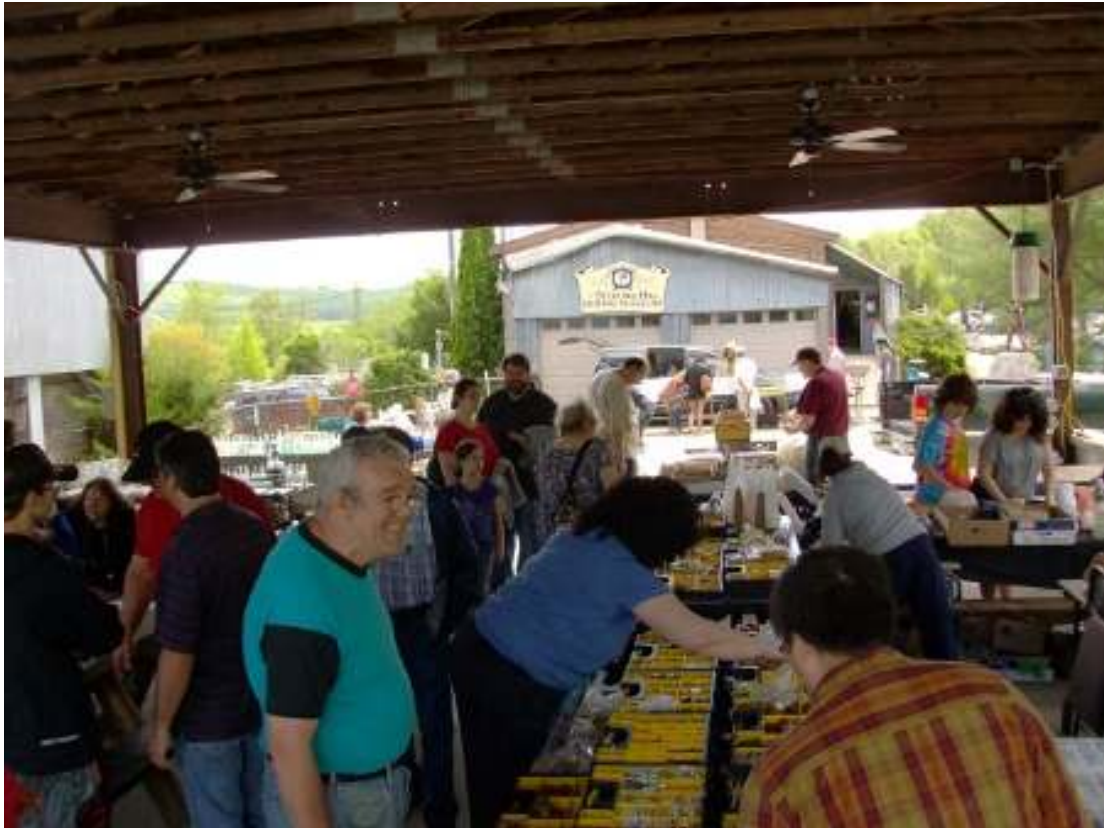
Steady flow of customers under the Pavilion