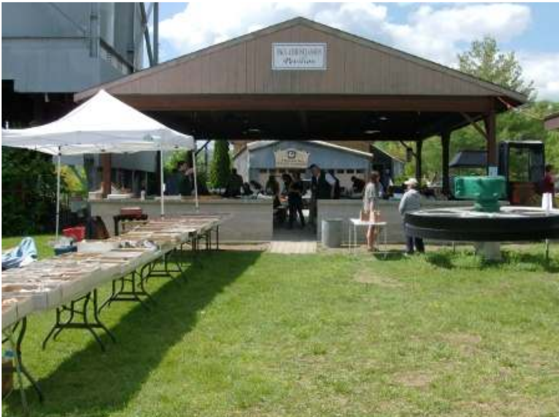
Dealers set up around the Pavilion