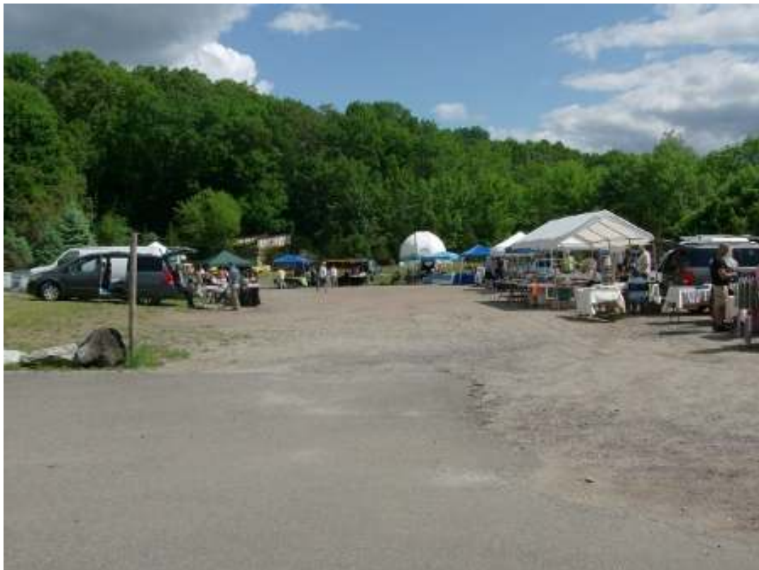
More dealers set up in the parking lot