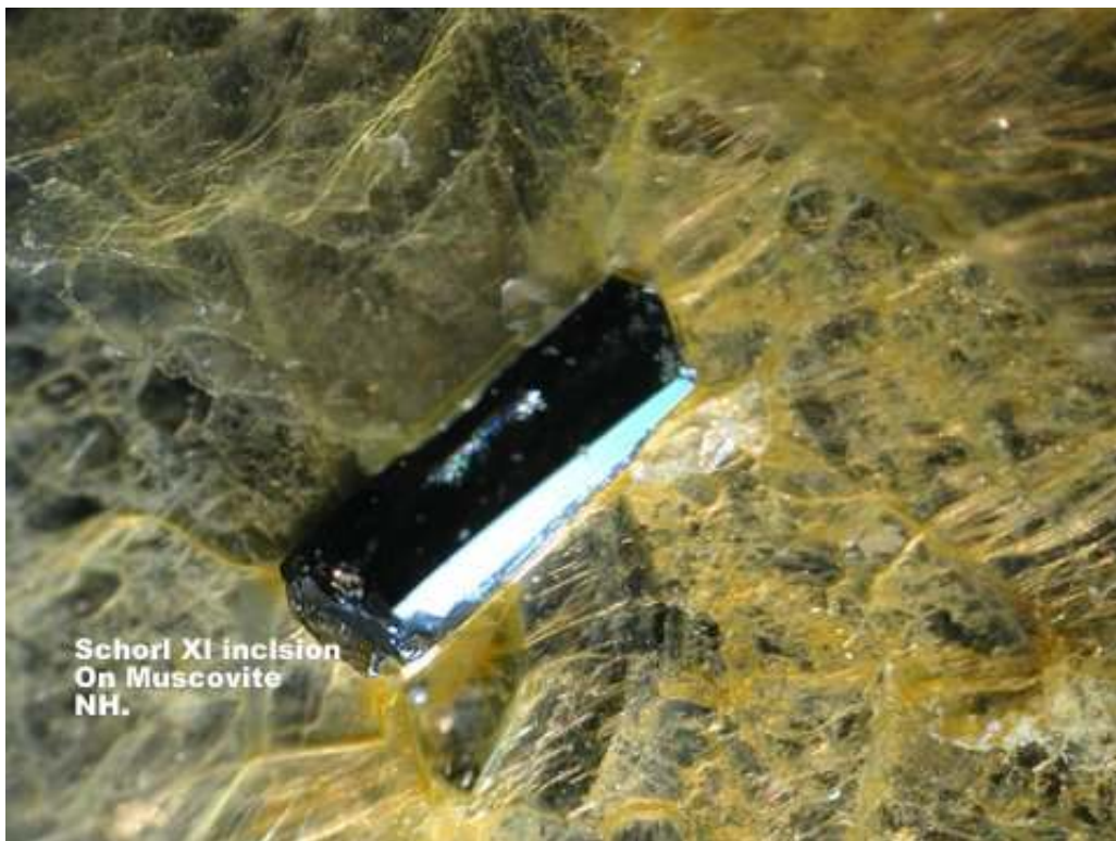
Schorl XI inclusion On Muscovite NH.