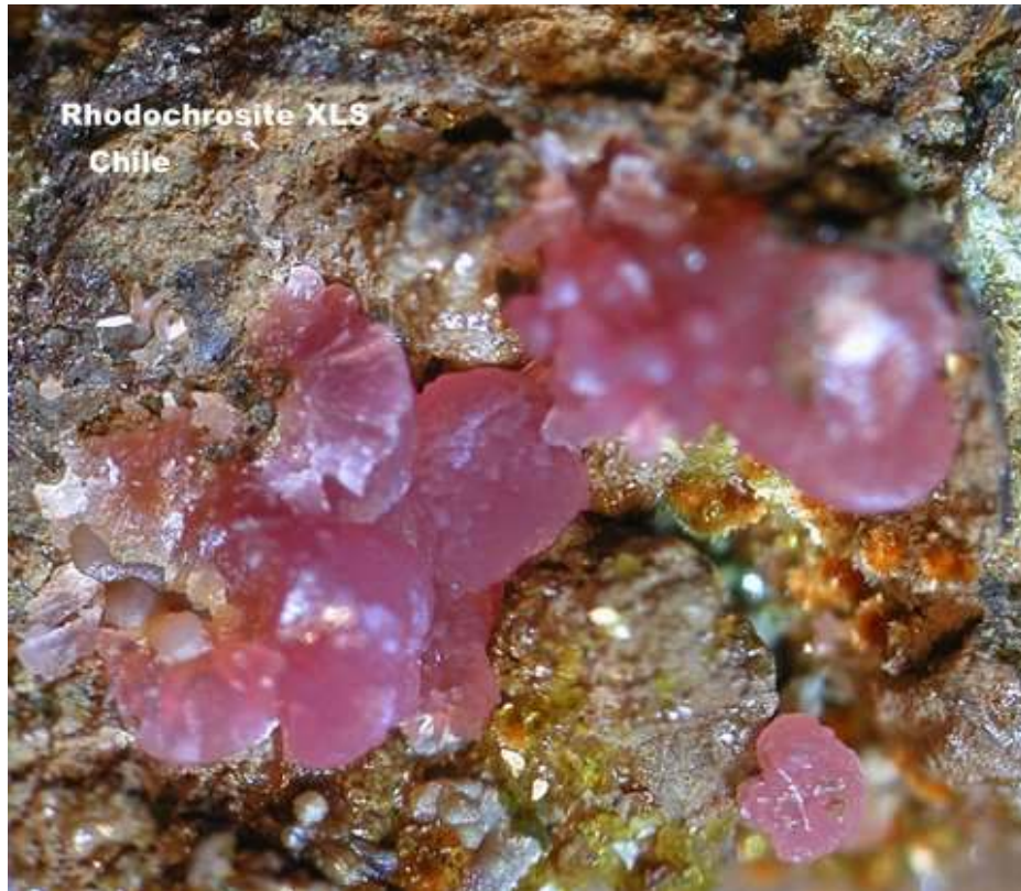
Rhodochrosite XLS Chile