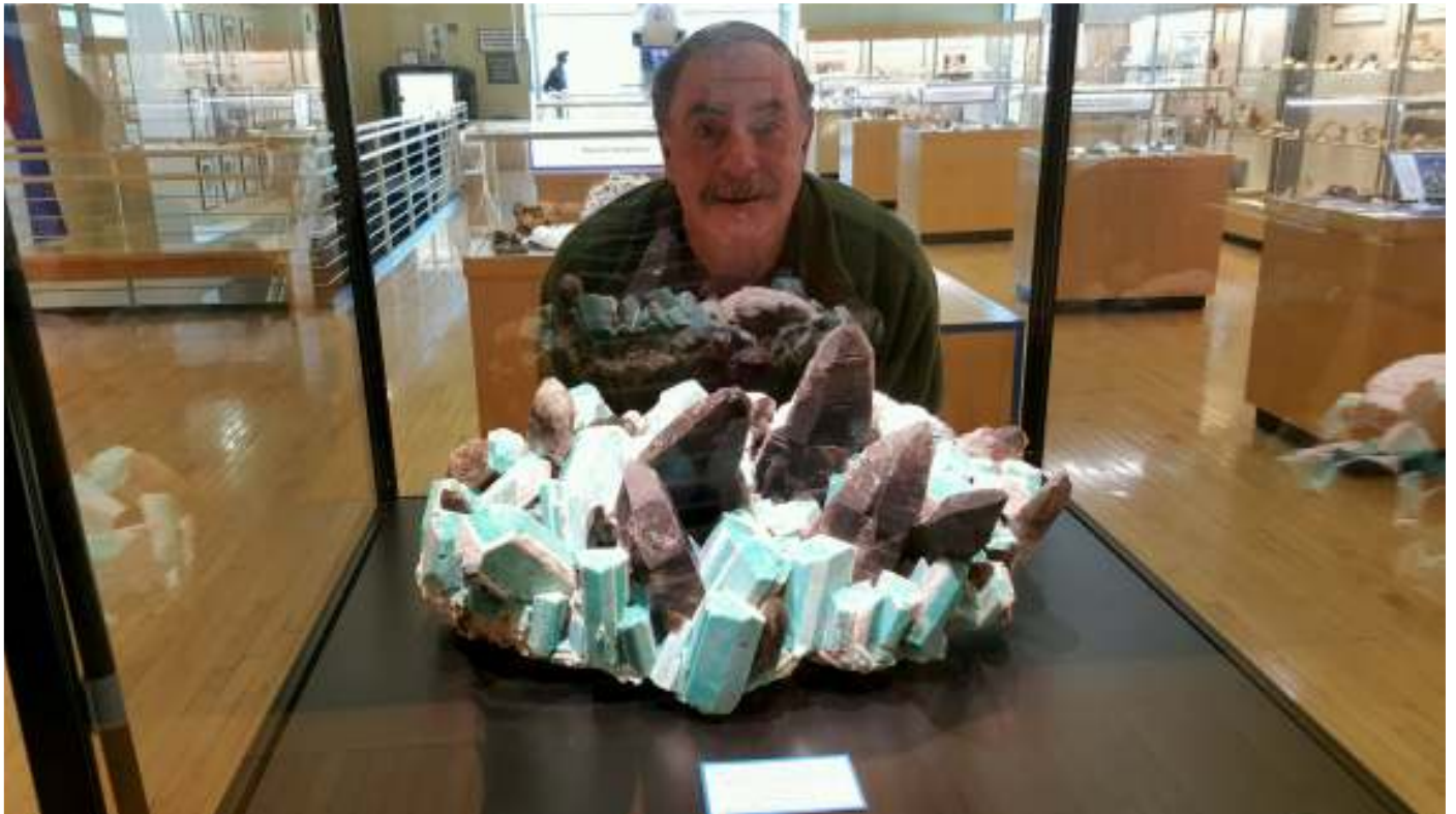
Awesome Amazonite with Smoky Quartz!!!