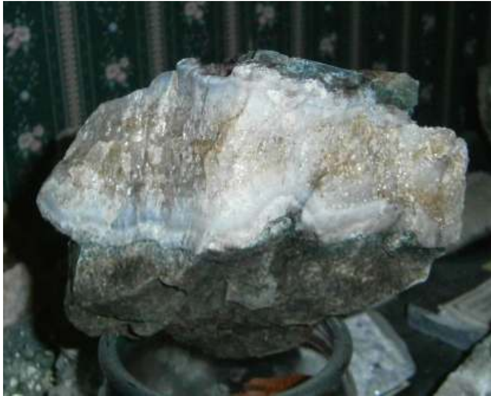
A 2.5" thick banded agate on basalt matrix, found by Jeff W