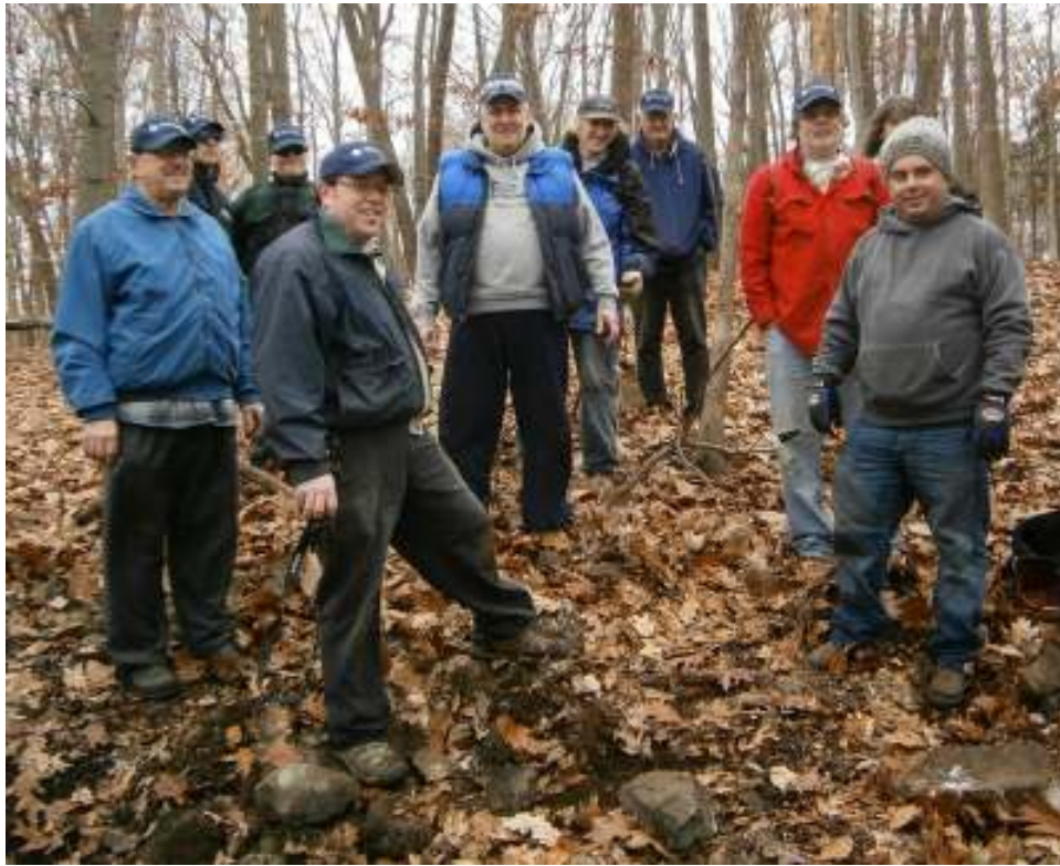
Group shot at the Agate Hill site