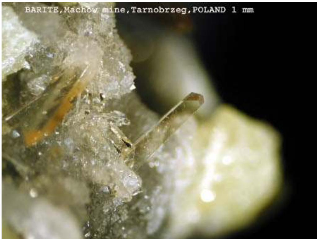
BARITE, Machow mine, Tarnobrzeg, POLAND 1 mm