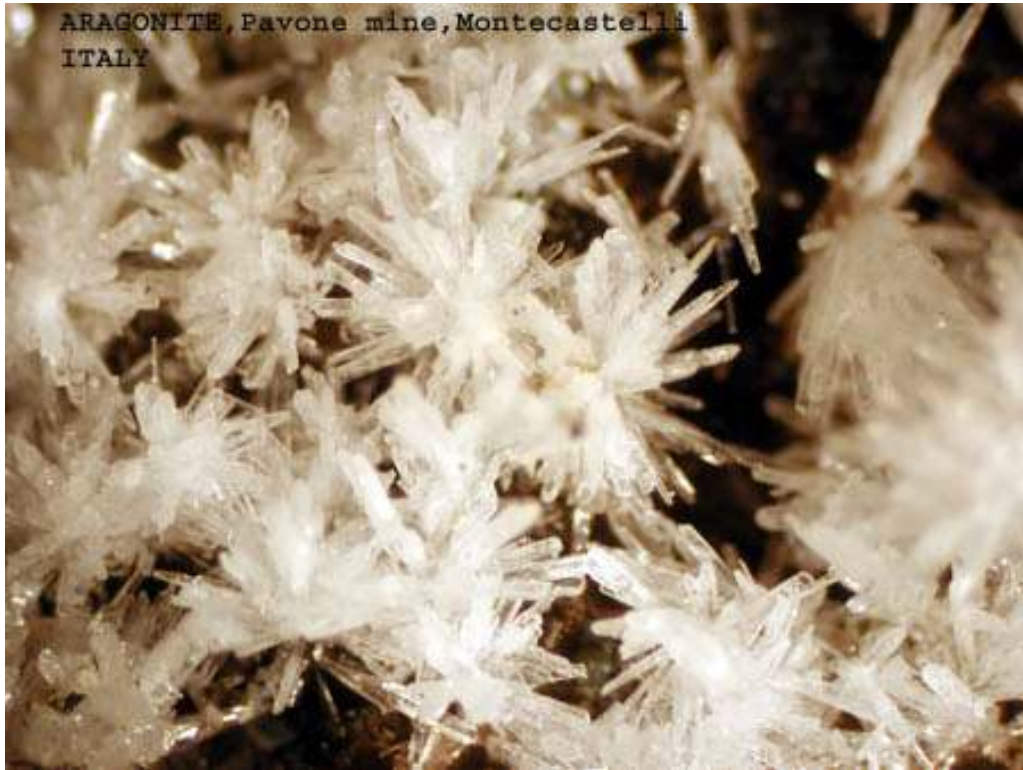
ARAGONITE, Pavone mine, Montecastelli ITALY