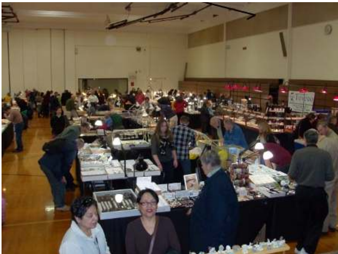
Some of the many dealers and customers at the show!