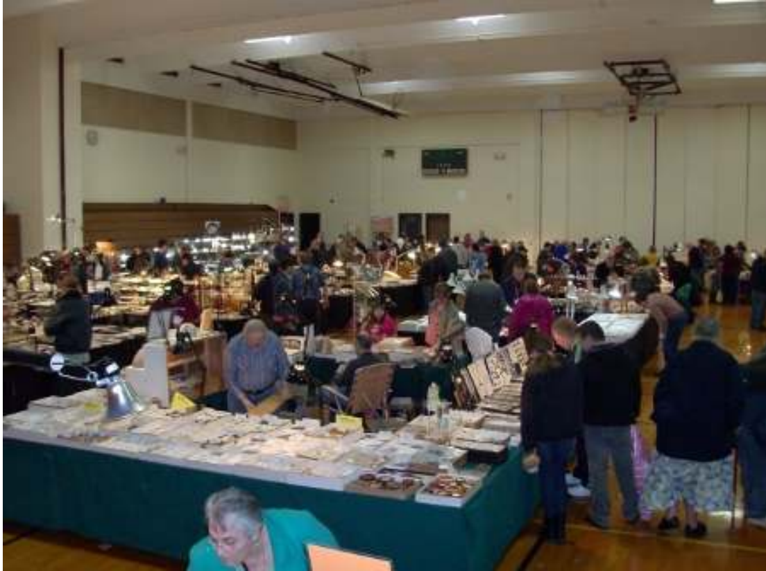
Some of the many dealers and customers at the show!